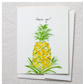
Thank-you card available in the Emily Post Garden Collection by Isa Salazar. Click image to view and purchase from the collection.